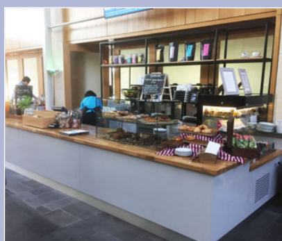
Wessex Water, Café

We are especially proud of the long term links we have with organisations where we undertake on-going reviews and audit services - Financial Conduct Authority, The Crown Estate, Wessex Water, The Royal Academy and The British Museum.