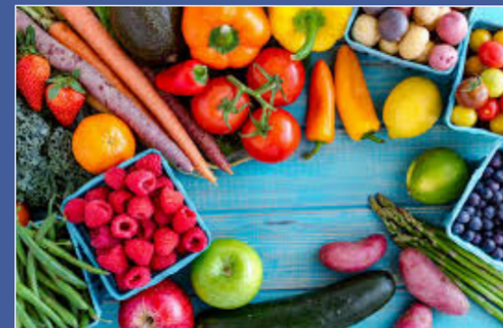
Plant Based Foods

The fast moving sector that is work place catering is as demanding as ever, as clients and their staff are seeking more innovation, more choice, healthier eating and food on the go. Throughout this year we have been assisting clients in the finance, property, utilities and communications sector from the Financial Conduct Authority to The Crown Estate.