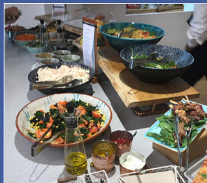
The Crown Estate, London

Down on the farm there are attractions that want to develop their catering from good to great. The trade organisations National Farm Attraction Network and FARMA use us to provide workshops and training sessions. Cotswold Farm Park, Sacrewell, Bluebell Dairy, Pink Pig Farm and Cogges Manor Farm have all been clients. A special mention to Fordhall Farm in Shropshire – we were so impressed with its 8,000 landlords: 1 Farmer and social mission that we have become a landlord owner too.