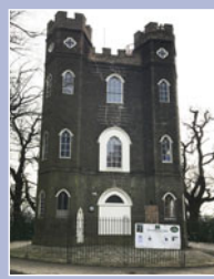
Severndroog Castle, South London