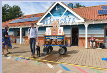
Holkham, Courtyard & Beach Cafés