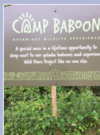
Wild Places, Bristol